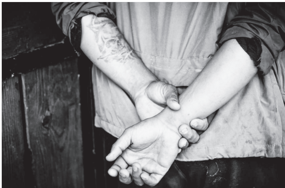
Photograph 3. Correctional Institution in Sremska Mitrovica, 2019.