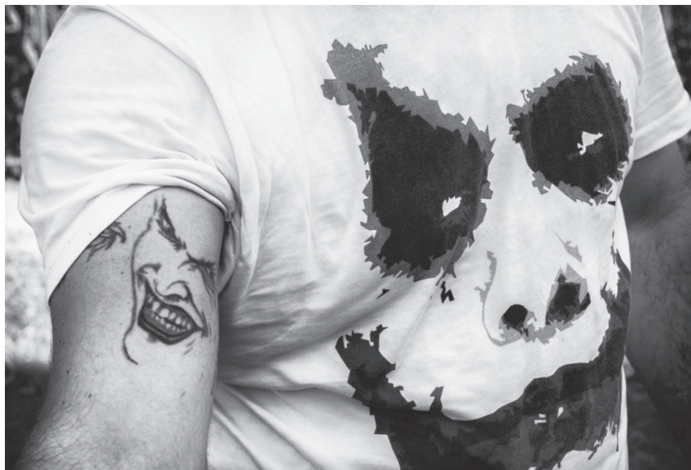
Photograph 1. Correctional Institution in Sremska Mitrovica, 2019.

Commodified prison tattoos (i.e. prison tattoos as commodified or purchased objects) include those tattoos that are used to construct prisoner's body, alongside with body-building (McCarron, 2008: 96). Namely, through marking his body with tattoos, the prisoner actually confronts the institutional marking that, just like mandatory wearing of prison uniforms, denies his individuality (McCarron, 2008: 96). Such approach to prisoners' perception of body-building and tattooing is plausibly depicted in an autobiographic novel "Record Atila" ( Dosije Atila ), written by a former prisoner Đorđe Vasiljević. When describing the process of body-building under prison conditions, he emphasizes that at that time for him, having a muscular body ornamented with prison-made tattoos represented the confirmation of his own value and the proof that the prison system did not manage to break him (Vasiljević, 2018: 206). He further confesses that he found an inmate who was willing and skilled enough to have him tattooed with a tattoo machine made from a ball pen, electric motor and batteries, using straightened and sharpened springs taken out from lighters as needles and a mixture of melted rubber slipper and shampoo as ink (Vasiljević, 2018: 206). Explaining the tattoo covering his arm and the upper part of his hand, visible even under long sleeves, he says that he deliberately chose a large tattoo that would always stand out and that could never be